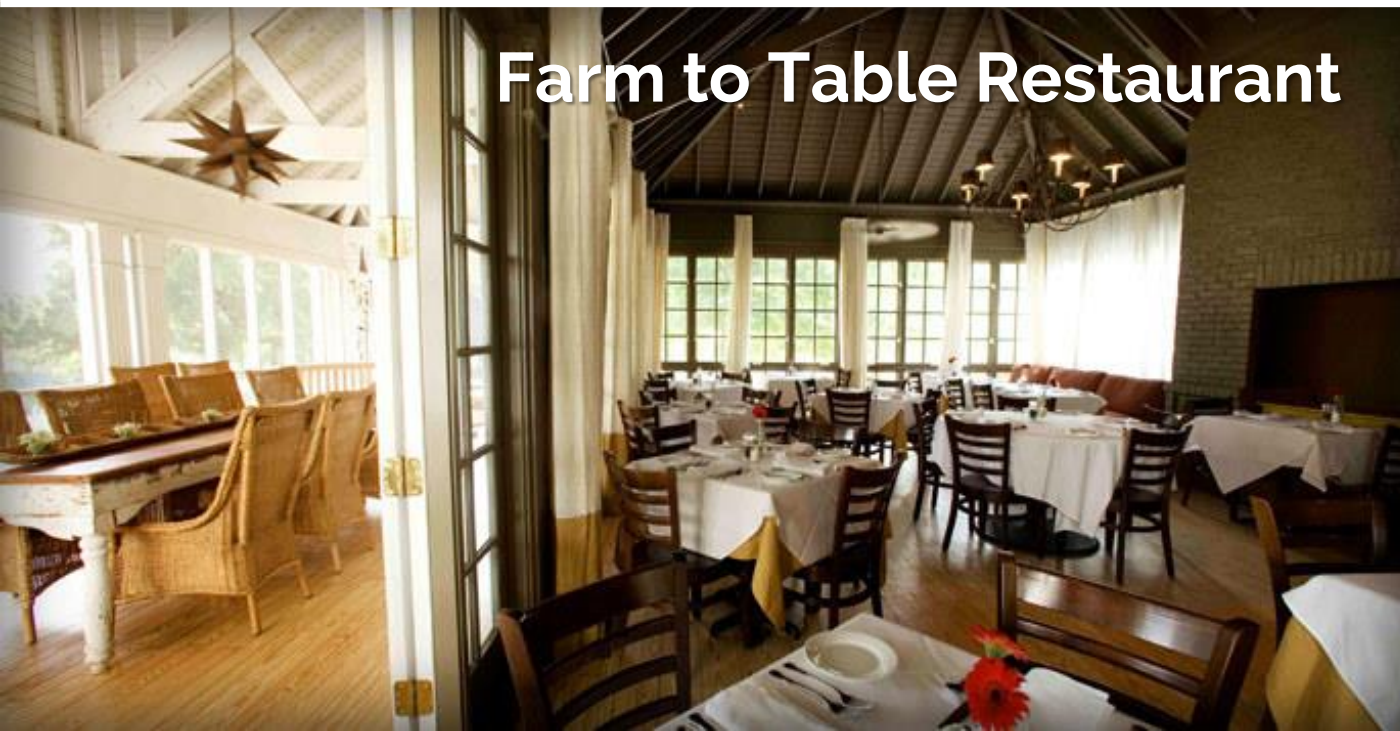
Farm to Table Restaurant