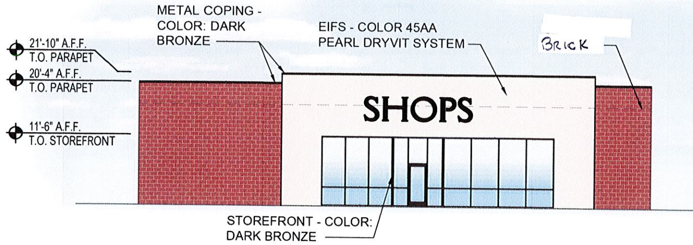
1 FRONT ELEVATION SCALE: 1/16"=1'-0"