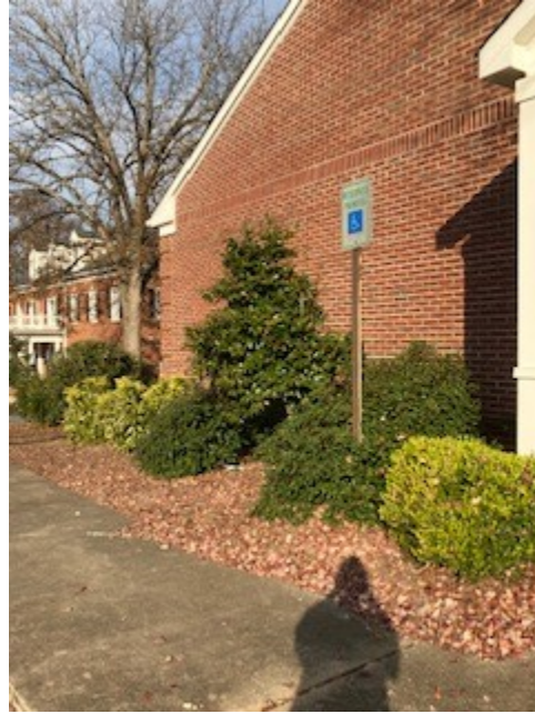
south side CD (front Marietta St)