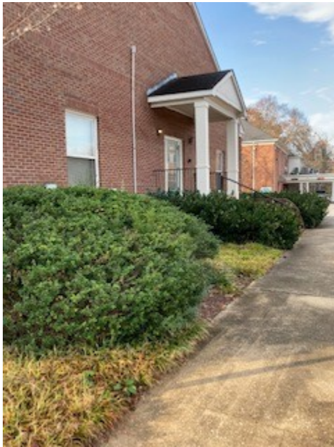
north side CD