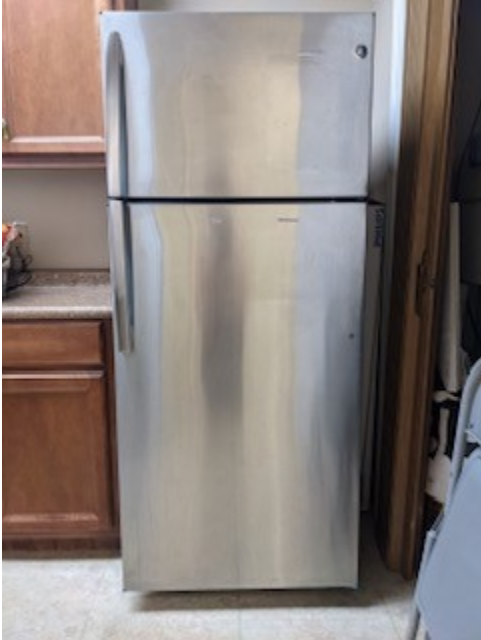
1 refrigerator at CD