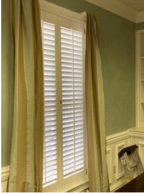
2 window treatments