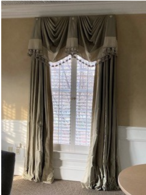
4 window treatments