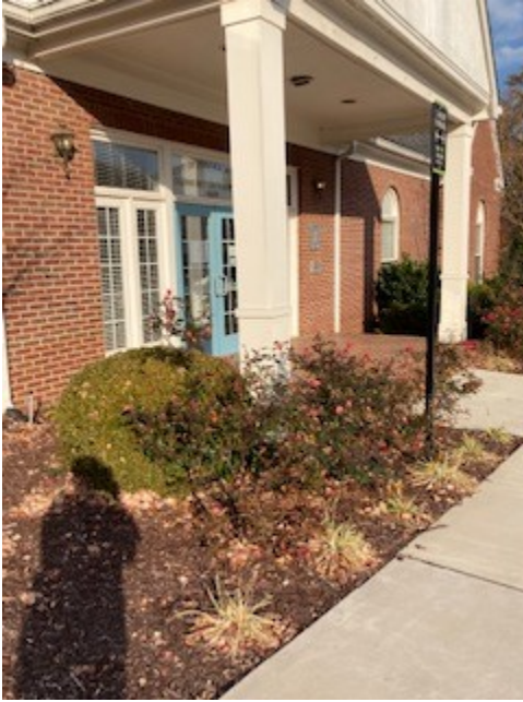
east side CD