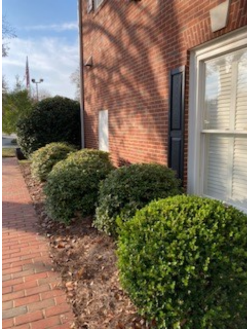
landscaping east side CH