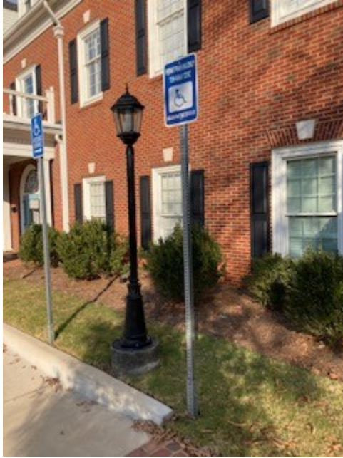
south side CH