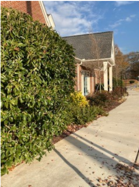
east side CD (fronting park)