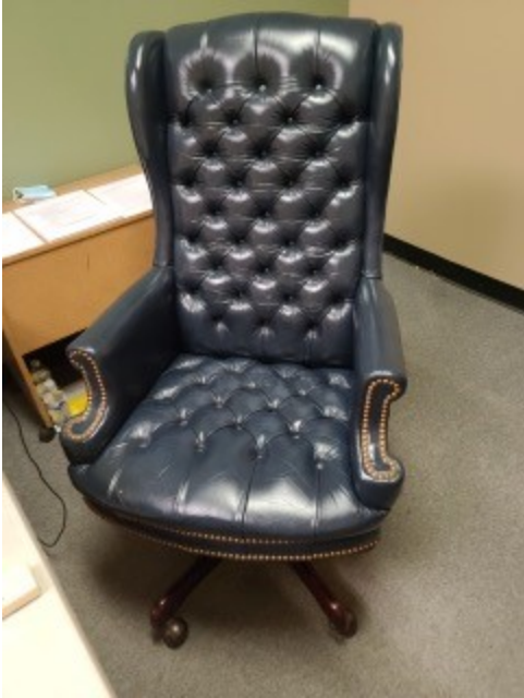
4 chairs from municipal court