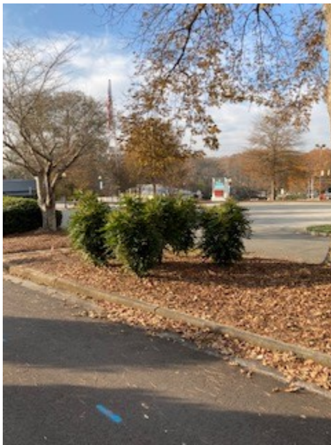
island between CH and CD