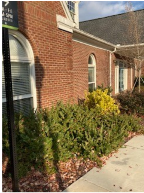
east side CD