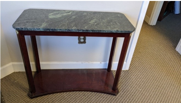
1 accent table CD