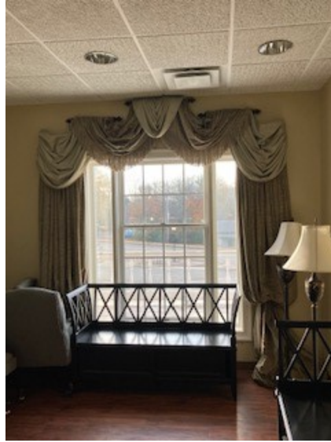
1 window treatment