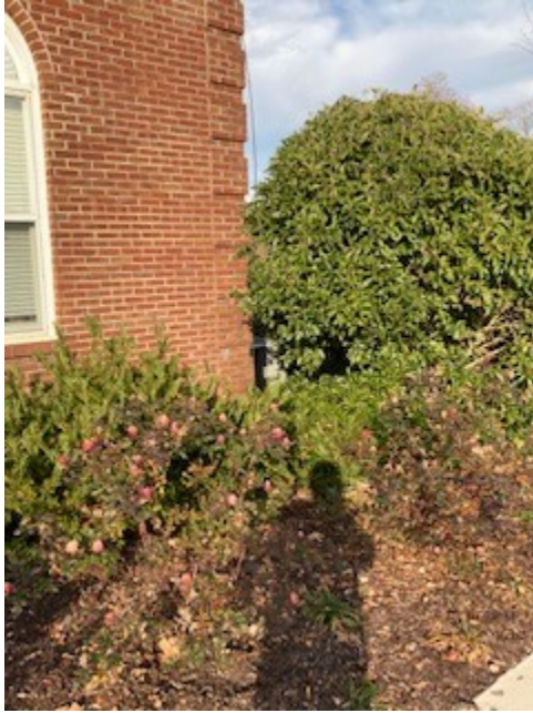
east side corner CD