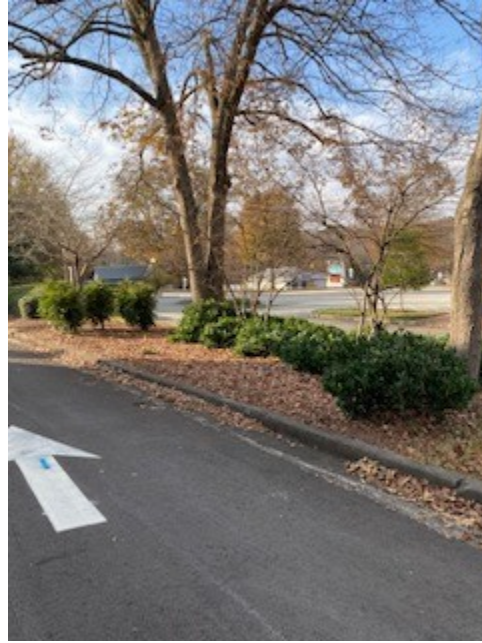
island between CH and CD