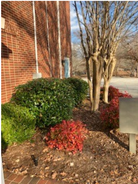
east side CH