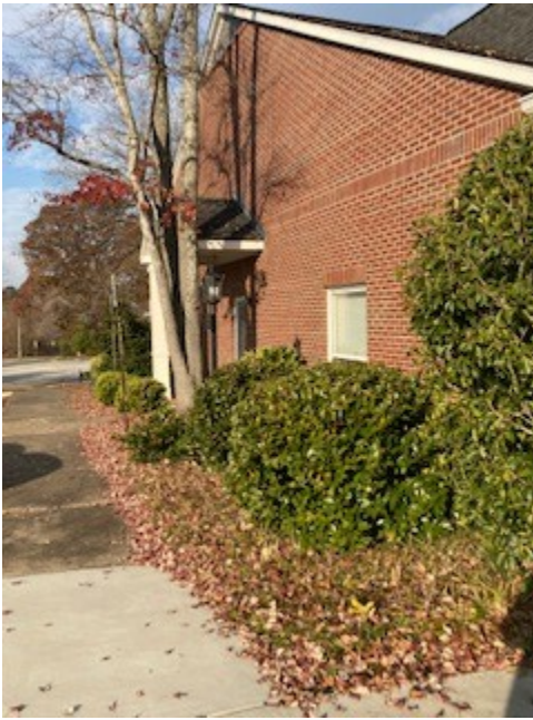
south side CK