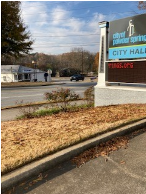
west side of sign