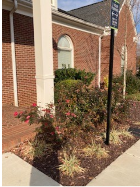
east side CK