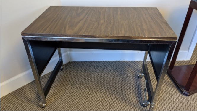
1 computer accent table with wheels CD