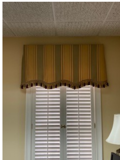
2 box window treatments