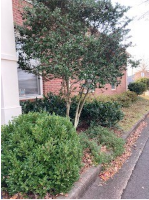
west side CK