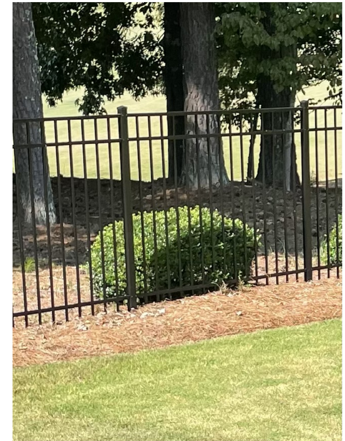
6" METAL FENCE