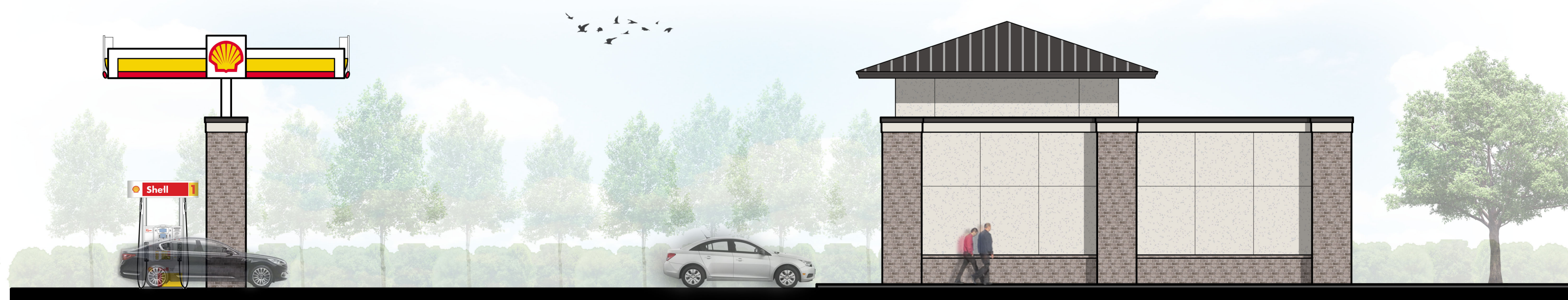
SIDE ELEVATION SCALE: 1/8" = 1'-0"