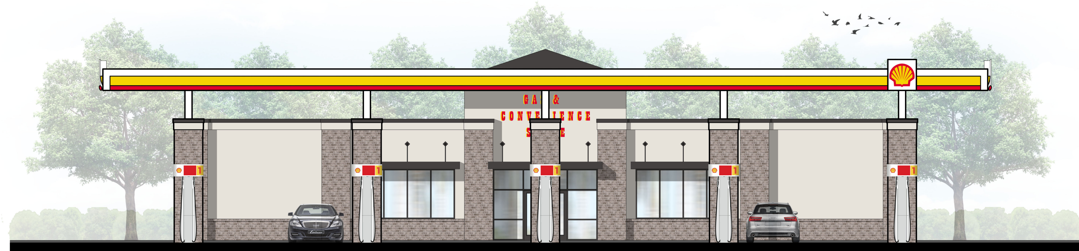
CANOPY FRONT ELEVATION SCALE: 1/8" = 1'-0"